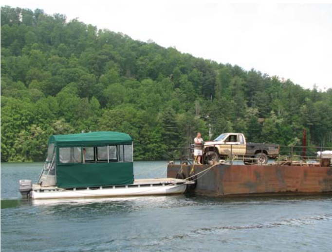
The Buck Knob Island barge and its hard working crew during the recent lake clean up

Pray for fine weather and see you on the water!