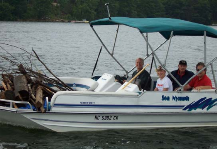
Friends of Lake Glenville Summer 2005