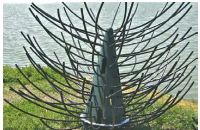
Proposed "Honey Hole" fish attractors. (Picture a traffic cone with plastic tubing sticking out).