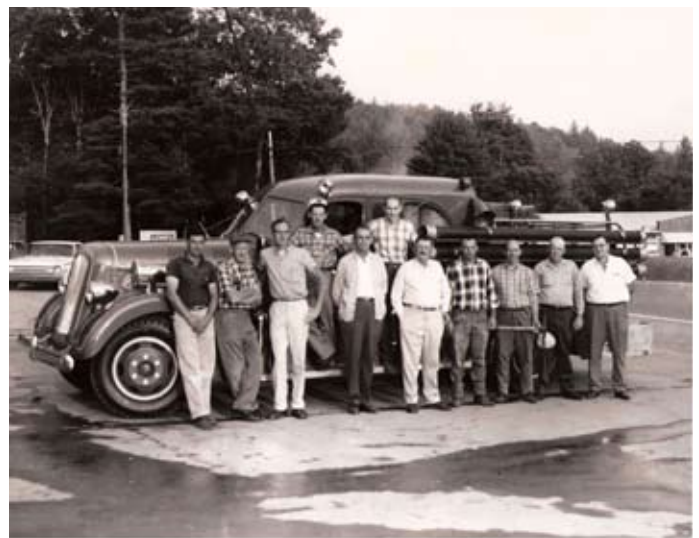
The department was founded in 1967. Shown is a picture of the Department Charter Members founding members with the departments first engine, a used 1946 Seagraves.

Fire protection is an issue that concerns both part-time and full-time FLG property owners. Members have requested this discussion as a Breakfast topic for a couple years. It is almost impossible to get these speakers during the summer months at the height of the fire season. We were pleased to book our speakers in May and will provide an update after the breakfast.