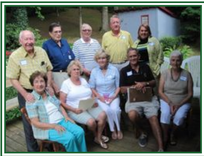
Glenville History Project Committee